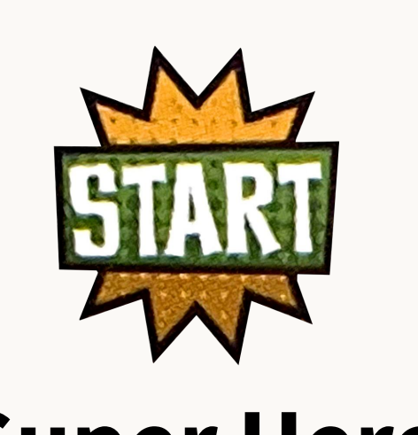
Super Hero Starting Zone