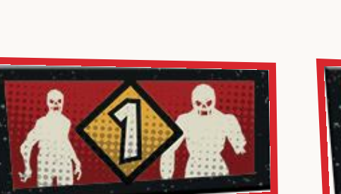
Spawn Points x4